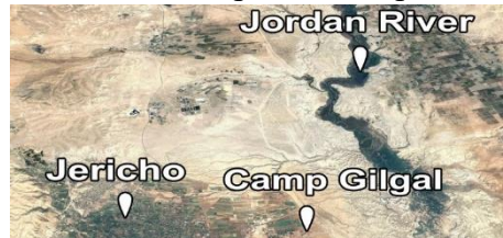
Figure 1i.23.204 https://www.holylandsite.com/gilgal

“Yes,” he replied. “The enclosure was in the shape of a footprint the shape of which is not directed by topography. There are about a half a dozen of these sandal-shaped enclosures in the Jordan Valley.” 60